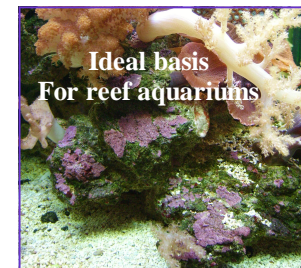
Ideal basis For reef aquariums

Cleaning of rocks is made naturally by fish such as ancistrus or snails.